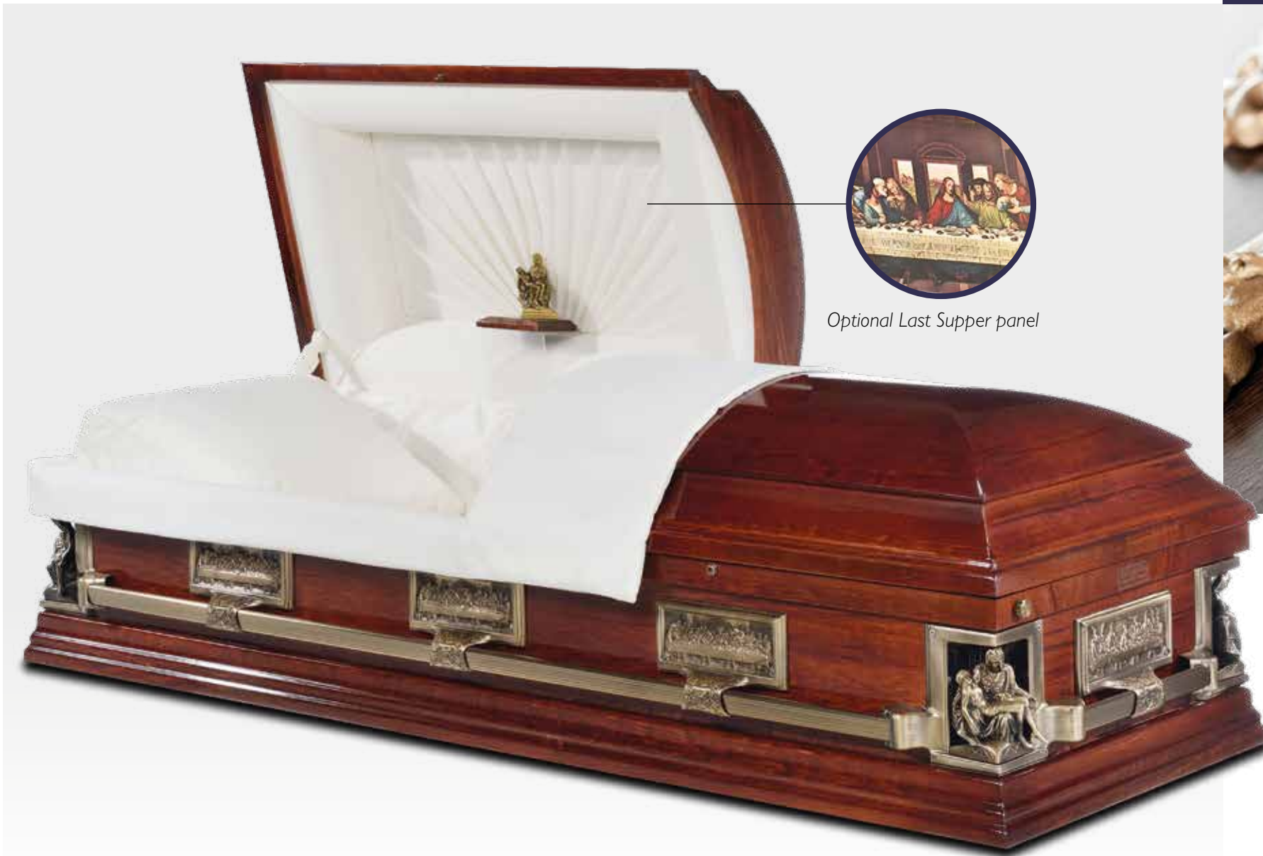
Optional Last Supper panel