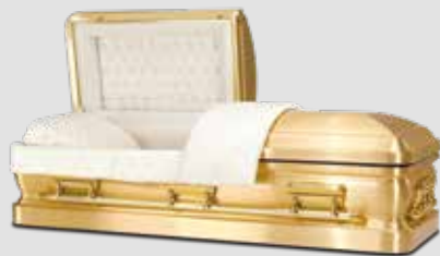
VEGAS PAGE 20