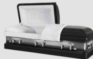
NIXON PAGE 17