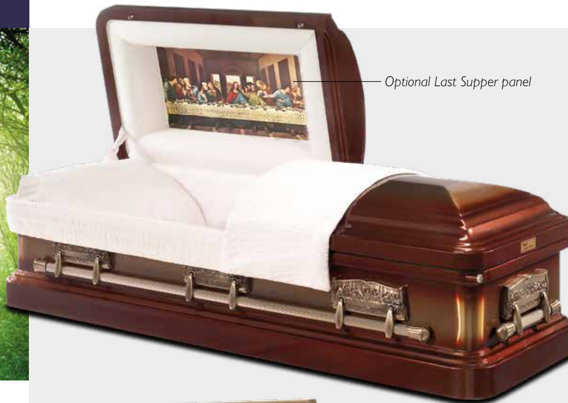
Optional Last Supper panel