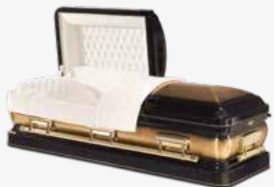
PHOENIX PAGE 16