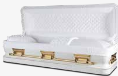
JACKSON PAGE 17