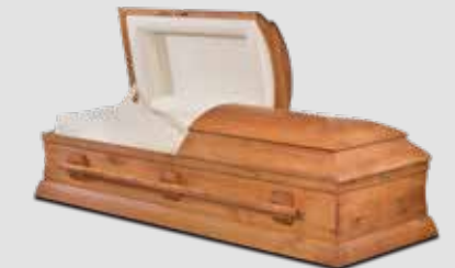
MICHIGAN PAGE 12

A wide collection of truly grand tributes.