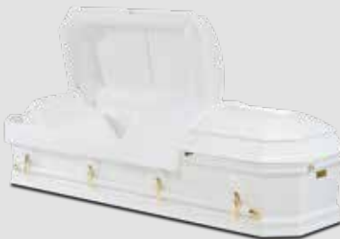
HOUSTON PAGE 11