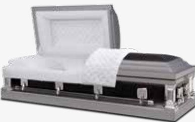
DETROIT PAGE 20