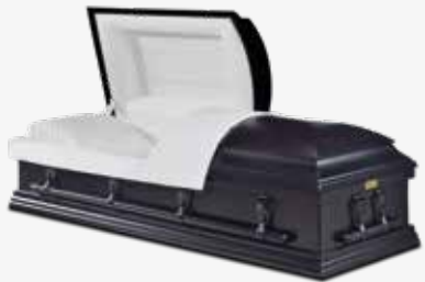
CLEVELAND PAGE 11