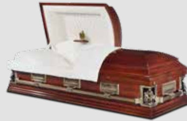
CORPUS CHRISTI PAGE 7