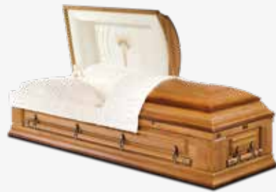
OAKLAND PAGE 6