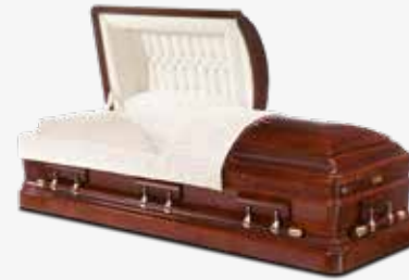
MEMPHIS PAGE 8