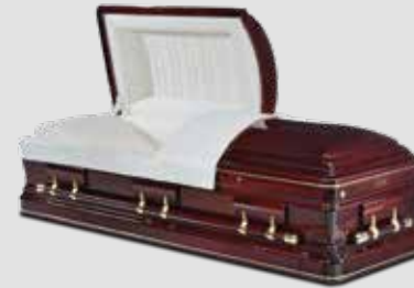
SINATRA PAGE 10