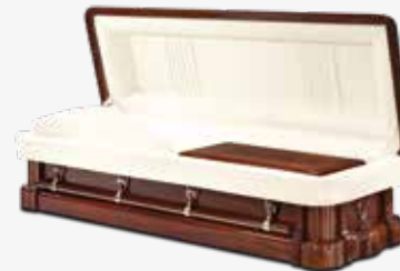
WASHINGTON PAGE 12