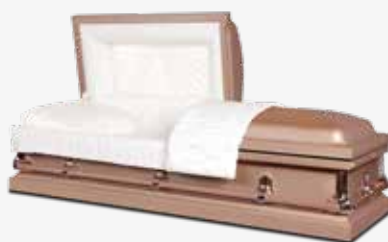
FRANKLIN PAGE 21