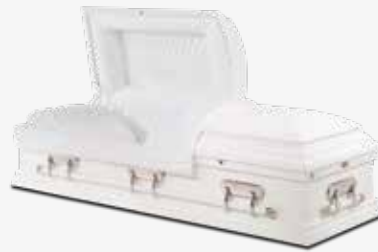
PRESLEY PAGE 9