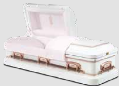
MONROE PAGE 16