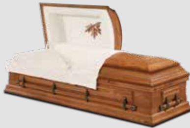
JEFFERSON PAGE 9