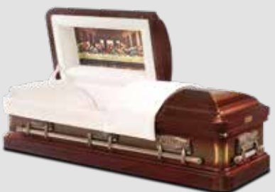
KENNEDY PAGE 18