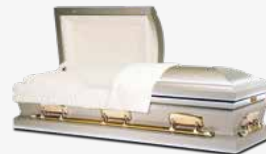
FONDA PAGE 19