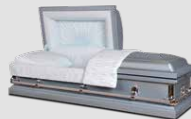
ARMSTRONG PAGE 21