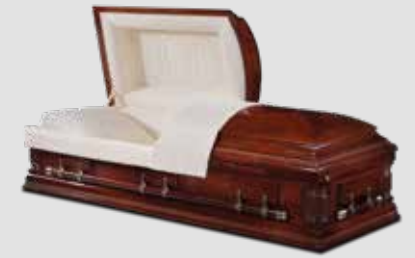
ARLINGTON PAGE 8