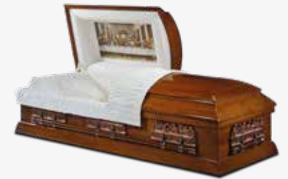
ST LOUIS PAGE 10