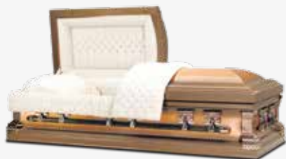
PRINCETON PAGE 18