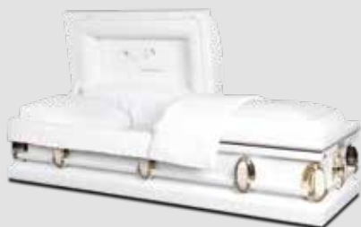
ASHFORD PAGE 19